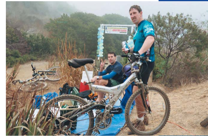
REI Ocean Classic, 2002